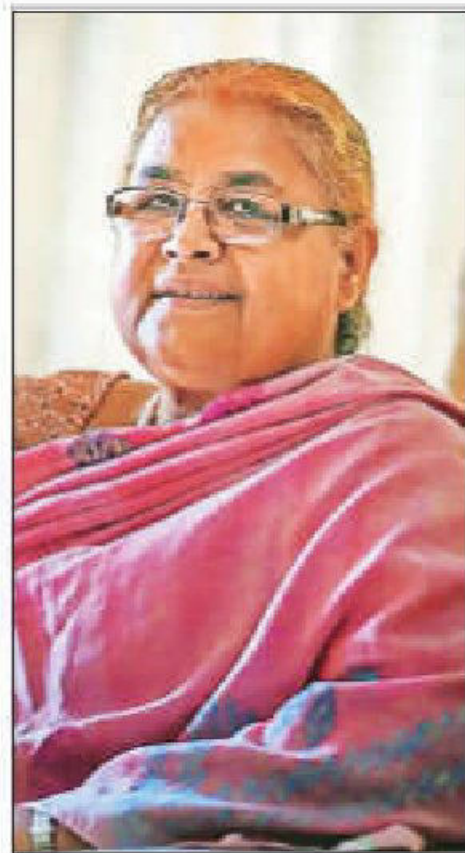
Former Nepal Chief Justice Sushila Karki