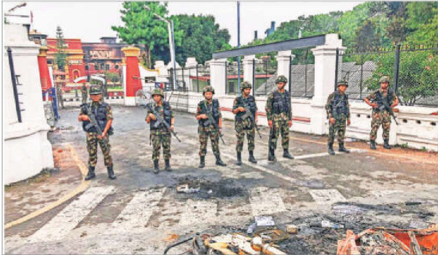
Security personnel stand guard at Nepali Rashtrapati Bhawan, which was vandalised and set on fire by protesters during the anti-corruption protest, in Kathmandu on Wednesday

In March this year, General Sigdel is said to have warned Oli not to arrest former King Gyanendra Shah or place him